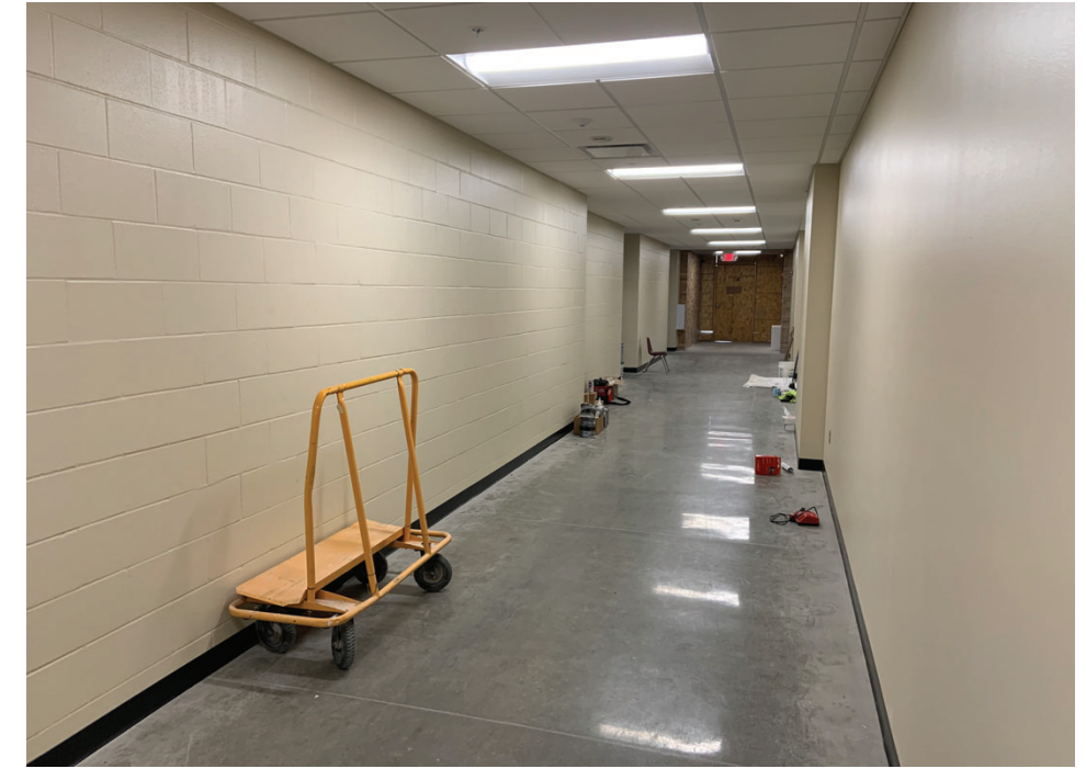
Even though its walls are still bare, the preschool wing (pictured) is nearly complete. The wing will comprise of two large rooms for "the littles" and an art/guidance room for TK through third grade.