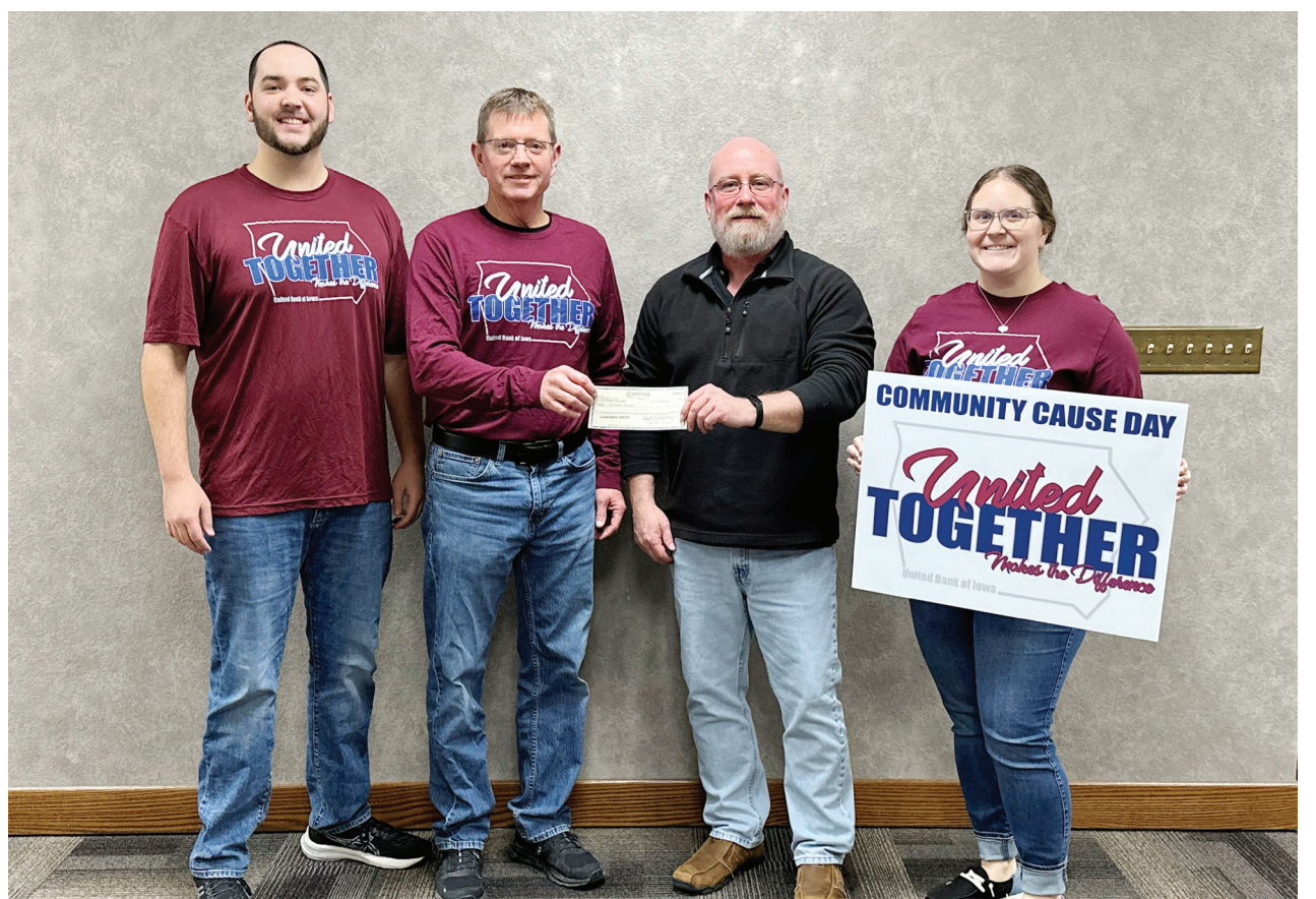
United Bank of Iowa recently donated $2,010 to Veterans Affairs of Calhoun County.